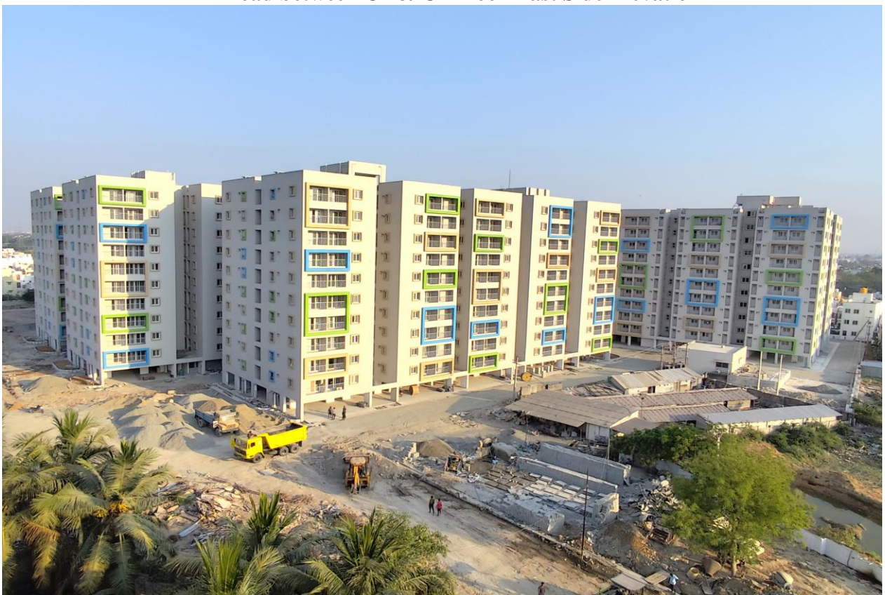
View of C1, C2 ,C3 & A1 Blocks