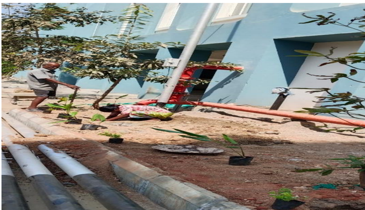
Landscaping work in Community Hall