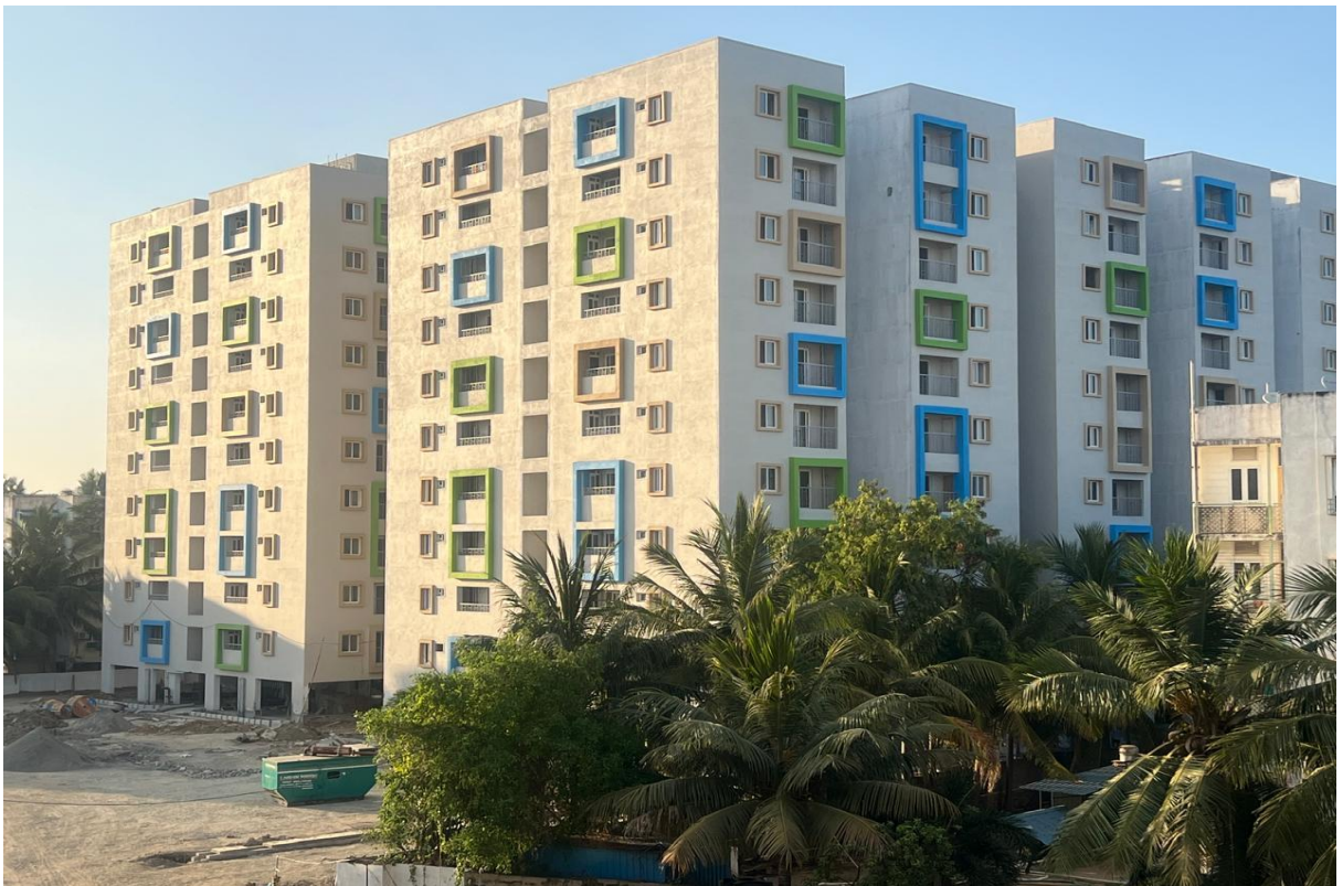
Block B1 & B2 – East Side Elevation