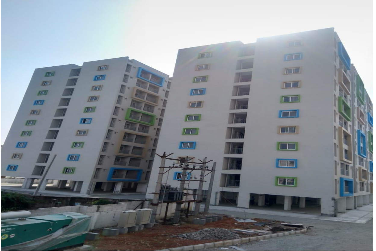
Block A1 & A2 – East Side Elevation