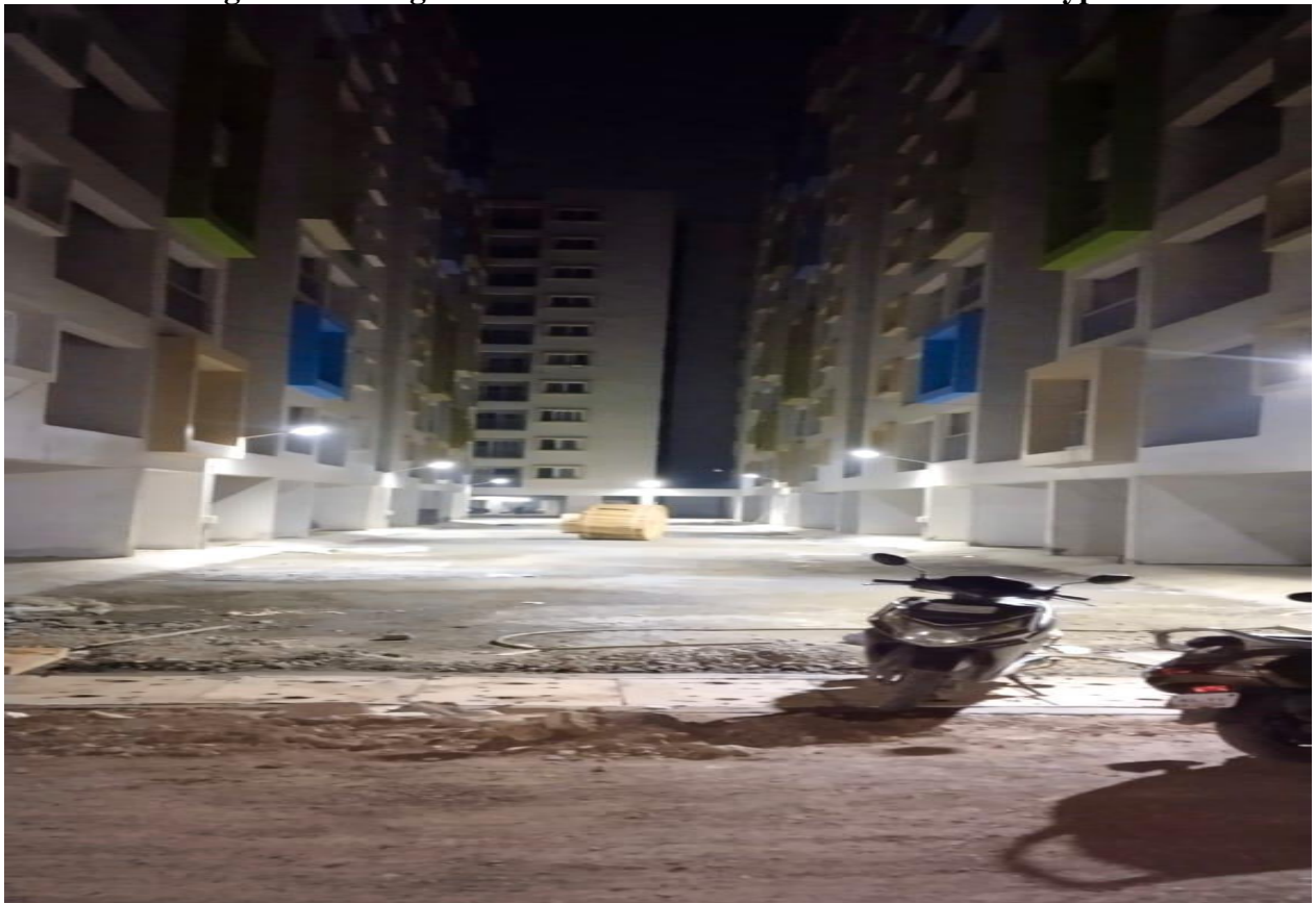
Night View with Street lights in between D1 & D2 Blocks