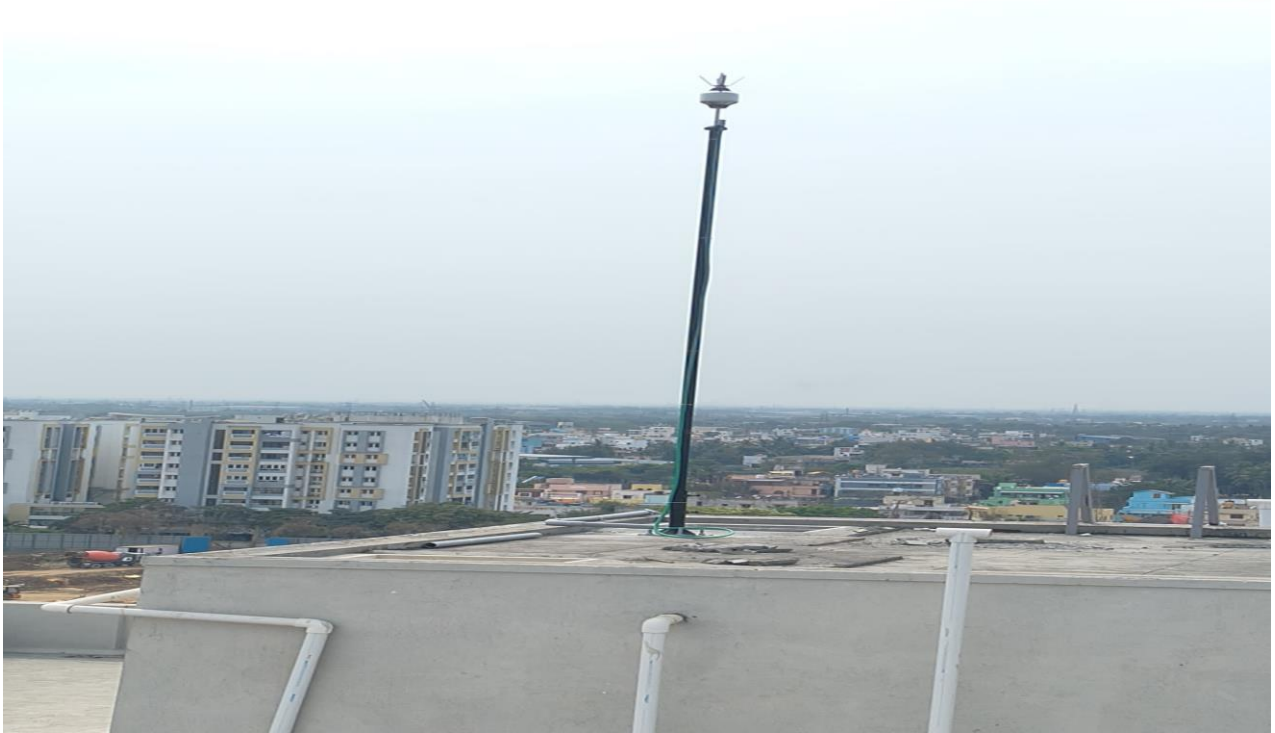
Lightening arrester in D1 Block