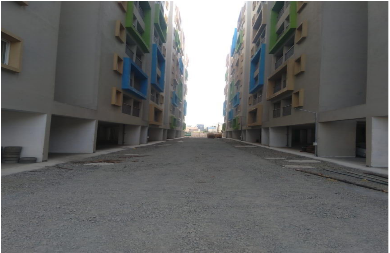
Road between C1 & C2 Block East Side Elevation