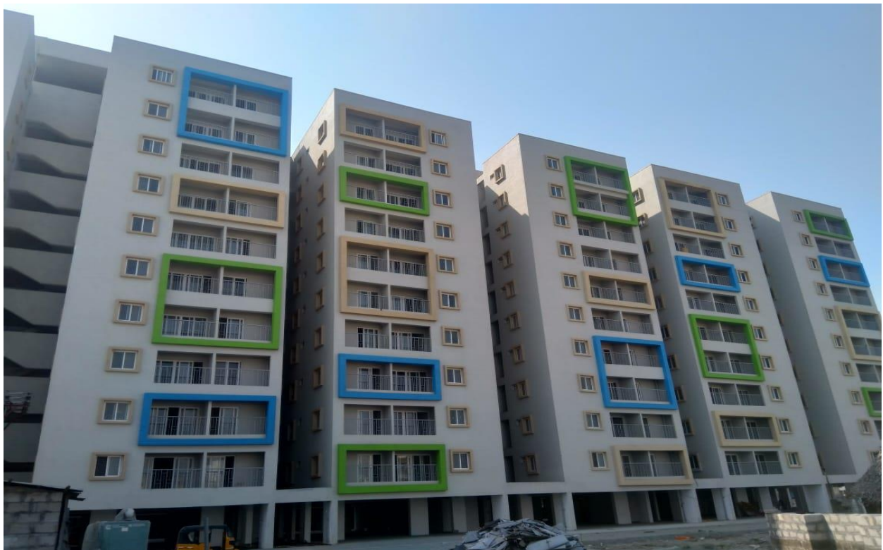
View of C1 Block East Side Elevation